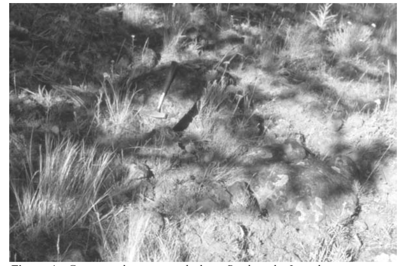
Figure 4. Coarse pediment gravel above Rattlesnake Ignimbrite containing mostly subrounded basalt boulders up to 1 m along their long axis.

I conclude that the Rattlesnake Ignimbrite, Late Miocene within the uniformitarian system, was deposited during the Late Abative Phase of the Recessive Stage of the Flood. This is because it stratigraphically overlies the Columbia River basalts (Figure 1) that were likely laid down as a huge sheet in the Late Abative Phase.<sup>17</sup> This timing is also indicated by the uniform thickness of the tuff.<sup>13</sup> A regular thickness implies that, at the time of the eruption, the topographical relief was very low over a wide area, which is consistent with conditions during the Late Abative Phase. Since emplacement, the deposit has been severely dissected by deep valleys, which form a new relief some 1,000 m below the rim of the plateau.<sup>13</sup> It is clear that the John Day Valley was dissected very rapidly after the tuff was deposited because the ignimbrite is tilted slightly downward towards the long axis of the valley. Such dissection and tectonics are consistent with the Dispersive Phase of the Flood. Pediments, which are widespread in the John Day