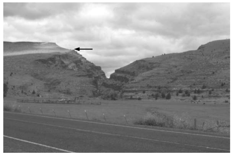
Figure 1. Picture Gorge water gap through the Columbia River Basalts in the John Day Country, North-central Oregon. The horizontal Rattlesnake Ignimbrite can be seen at the top of the strata to the left of the gorge (arrow).

Recently, the case for the underwater welding of tuffs