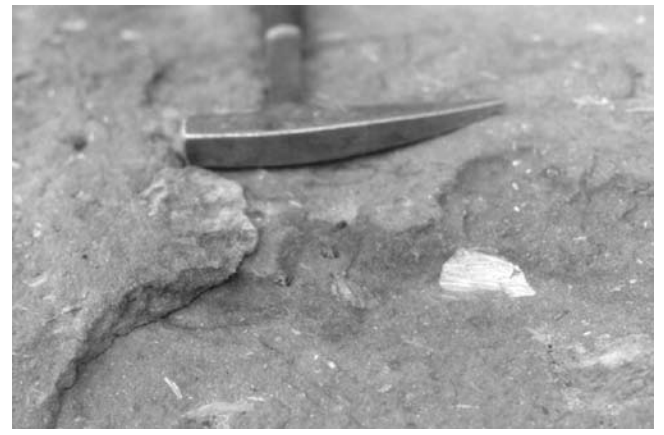
Figure 3. Base of Rattlesnake Ignimbrite, just below the welded tuff, showing random pumice clasts.

been transported completely out of the region. Deep, dissected valleys, as observed in the area, are typical of what is to be expected during the Dispersive Phase of the Recessive Stage of the Flood.<sup>10</sup> This means that the Rattlesnake ignimbrite, one of the highest formations stratigraphically in the region, was emplaced during the Flood , most likely underwater and subsequently uplifted.