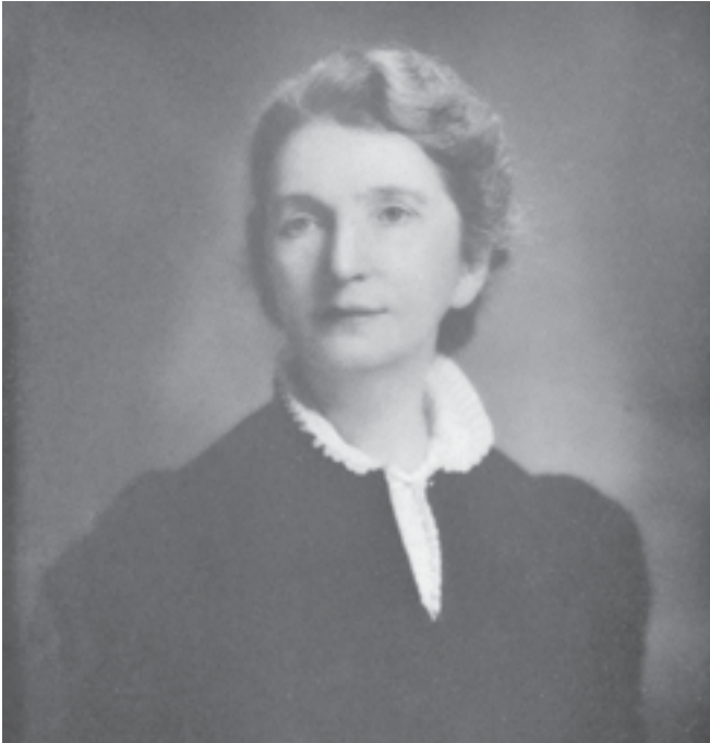
Margaret Sanger around 1938 (From Sanger 35 ). All authorized published photographs, including this one, were staged in an attempt to show Mrs Sanger as a conservative, serious, middle class and very respectable lady.

if those who are weak were put upon one side and crushed, if those who were old and useless were killed, if those who were not capable of providing food for themselves were allowed to starve, if all this were done, the struggle for existence among men would be as real as it is among brutes and would doubtless result in the production of a higher race of men. 40