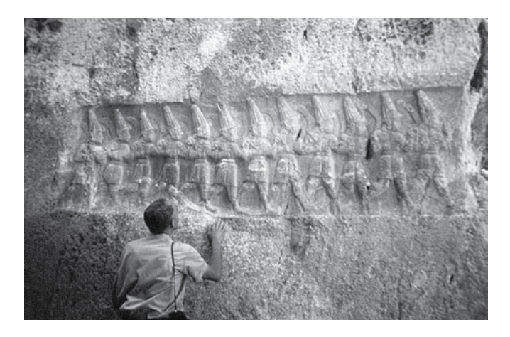
Figure 2. Relief of Hittite gods at Yazilikia. Tudhaliyas IV was the last great king of the Hittites. He was a pious man and left these reliefs of Hittite gods on the face of the rocks at Yazilikiya.