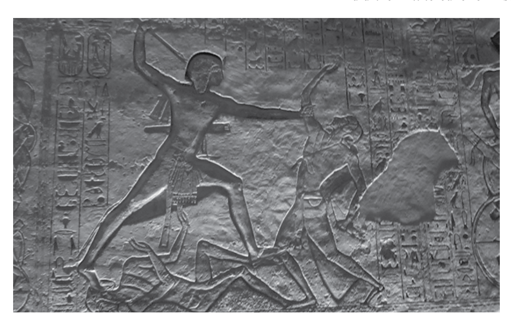
Figure 6. Rameses killing Hittites in the Battle of Kadesh. In this relief in the temple at Abu Simbel in Egypt Rameses II boasts of his wars against the Hittites, so these kingdoms must have been contemporary, however Rameses is usually dated to the 13<sup>th</sup> century BC whereas Assyrian inscriptions record their wars against the Hittites 500 years later.

'The lack of accurate chronological or genealogical data for the Hittite kings precludes the possibility of accurate dating at this time.'<sup>17</sup> 'Our understanding of the late Old Hittite and Middle Hittite periods suffers from a scarcity of documentation.'<sup>18</sup> 'The actual end of the Hittite Empire can only be guessed at for the obvious reason that no one was left to chronicle the event after the capital was taken around 1200 BCE. See Singer 1985 and 1987 for problems dating the fall of the empire. With the sacking of Hattusa the centralized Hittite polity came to an end forever, as did the Hittite cuneiform scribal tradition. No Hittite