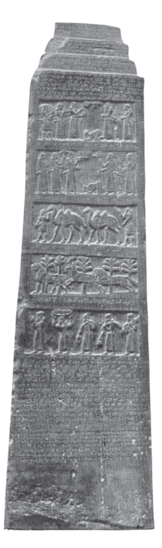
Figure 4. The Shalmaneser Pillar in the British Museum. This pillar was made by Shalmaneser III and depicts Jehu bringing tribute to the Assyrian king. He records his wars against the Hittites in the 9<sup>th</sup> century BC though the Hittites were supposed to have been eliminated about 1200 BC.