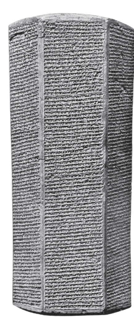
Figure 5. The Sennacherib Prism. The Bible says that Sennacherib besieged Jerusalem but did not capture it. This prism of Sennacherib claims he shut up Hezekiah like a bird in a cage, but he did not claim he captured Jerusalem. Sennacherib in the 8<sup>th</sup> century BC records his wars against the Hittites.

records his wars against the Hittites, and these were not just trivial skirmishes against some surviving remnants of the Hittites (figure 4). It was all-out war against a major power.