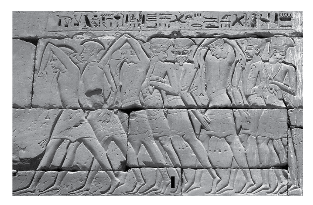
Figure 3. Reliefs on the walls of the temple of Rameses III at Medinet Habu depict people called Peleset or Pereset. They are usually identified as Philistines but they rather bear resemblance to Persian soldiers, indicating a later date for Rameses III.

Luxor. These inscriptions describe at length Rameses III's battles against them.