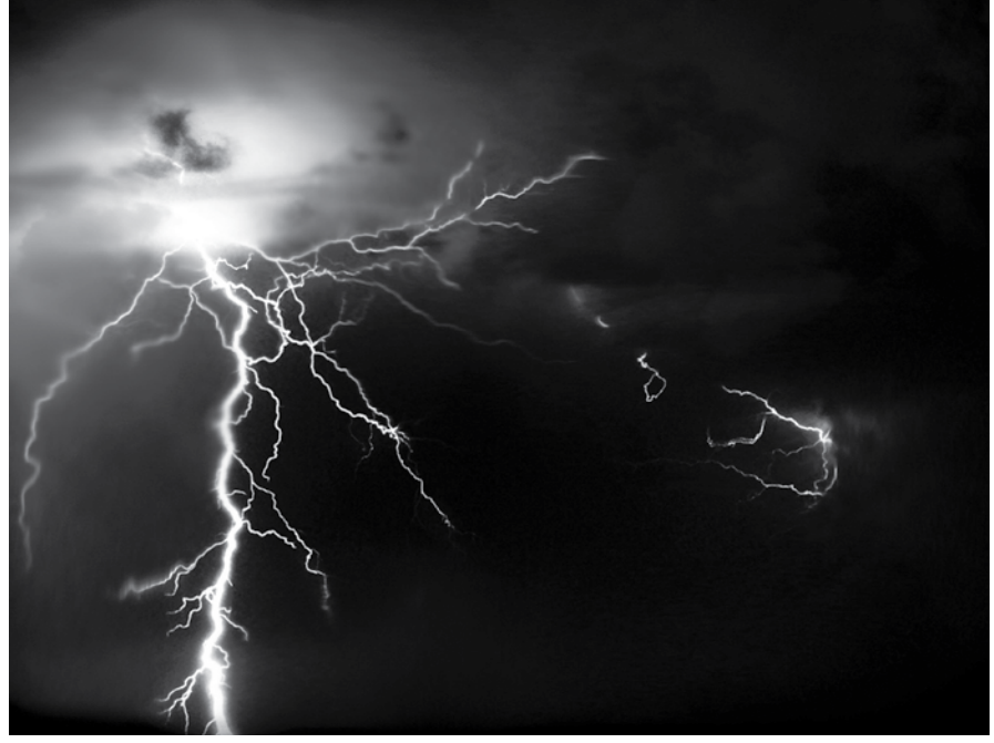
Lightning often figured prominently into ancient superstitions as an attribute of deities. Lennox points out that in order to understand nature scientifically, it was necessary for nature to be "de-mythologized"; and that the greatest force for de-mythologizing nature was the biblical doctrine of a Creator God existing independent of His creation.

"It is very striking that the most abstract mathematical concepts that seem to be pure inventions of the human mind can turn out to be of vital importance for branches of science, with a vast range of practical applications" (p. 60).