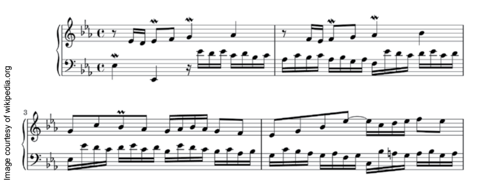
Figure 2. The human brain represents music using at least a dozen networks. Some people even perceive other mental images along with music, such as colors and shapes.

"The LORD your God is in your midst, a mighty one who will save; He will rejoice over you with