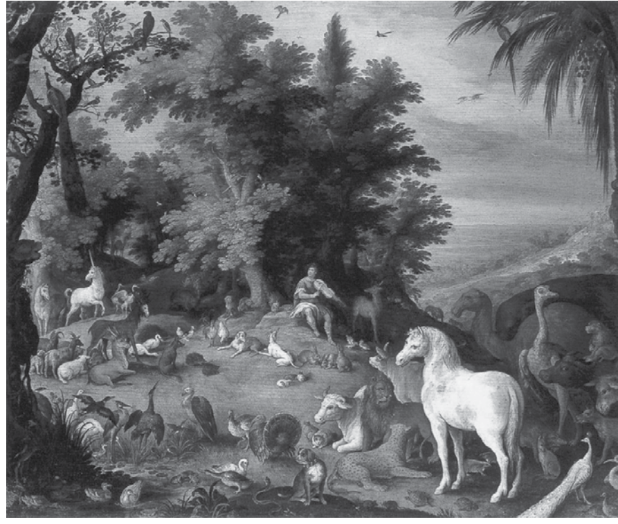
Figure 1. Though many animals respond to music (like the animals above surrounding the mythical figure Orpheus), and some have been trained to apparently perform to music, no animal has the sophisticted brain mechanisms for representing music that nearly all humans have.

Not only do these evolutionary explanations contradict each other, but they are in opposition to what Sacks himself has observed and claimed—