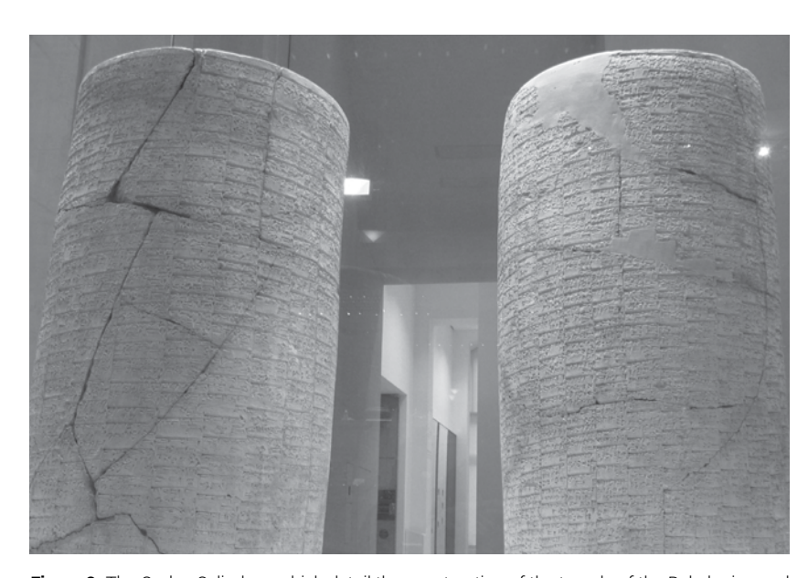
Figure 2. The Gudea Cylinders, which detail the construction of the temple of the Babylonian god Ningirsu (Ninurta) at Lagash (in modern day southern Iraq), dated to around 2100 BC

"Then on the seven[th] d[ay], The fire went out in the house, the f[la]me, in the palace. The silver had turned to plates; The gold had turned to bricks.