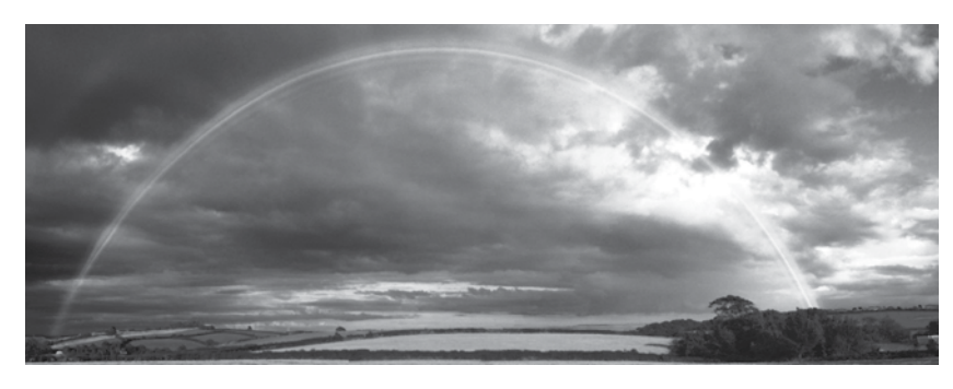
Figure 1. God's covenant to never flood the world again was made not only with Noah, but "all future generations" (Genesis 9:12). This implies that the worldwide Flood occurred in the real past and was not merely a literary device.

God's promise was not merely that He would now preserve the world, it was that He would not repeat such a Flood (figure 1). He said, "never again shall all flesh be cut off by the waters of the flood, and never again shall there be a flood to destroy the earth" (Genesis 9:11; cf. 8:21; 9:15; Isaiah 54:9). But what was God promising not to repeat in Longman